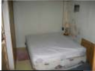
CURRENT STAFF TRAILERS